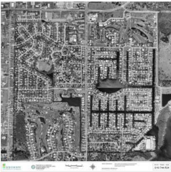
Black & White Aerial